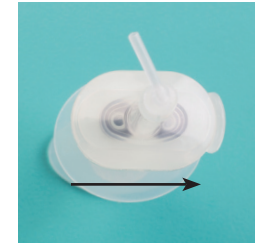
Figure 4: Slide and Ready

Slide the tip portion all the way over until it hits the side stop. Always "bleed" some material before going to the mouth.