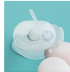
Figure 3: Prepare for Use

After loading, push the plunger in until the material is almost up to the O-rings. Then, slide the tip portion over until stopped by the side tab. The tab keeps the material from mixing until ready for use.