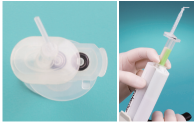
Figure 1: Initial Loading Position

Minimize impression material waste by filling BFC syringes with only the amount of wash material you need—half-full is enough to record one crown prep, and full is enough for three preps.